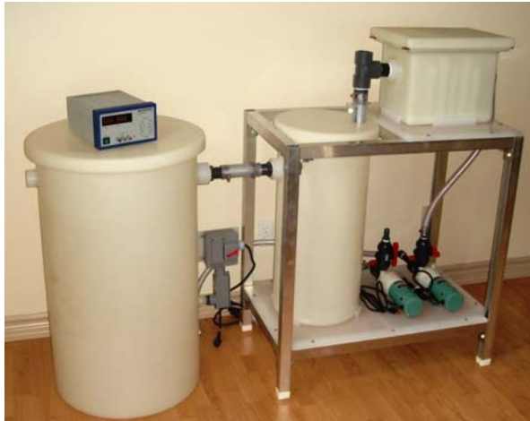
Gold EW pilot plant with 5 A rectifier

This gold electrowinning plant was designed and manufactured by SX Kinetics for a project in Sonora, Mexico. The plant has the capacity to produce up to 20 kg of gold per month.